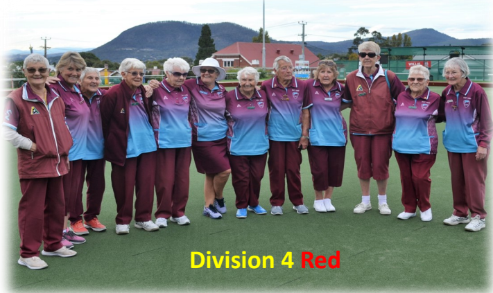
Division 4 Red