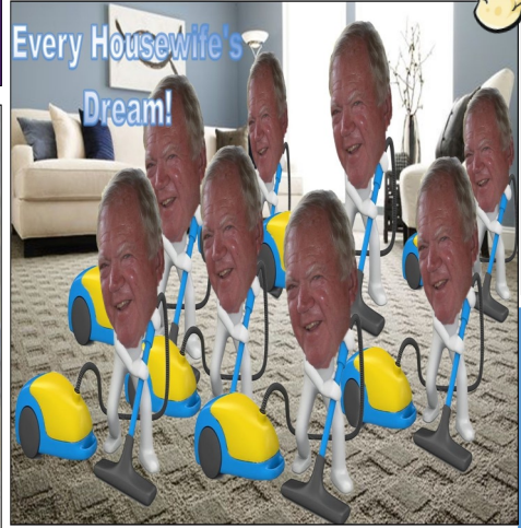
Parts of this newsletter have been digitally altered.