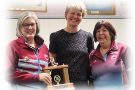
(above) 2021-2022 Presentation