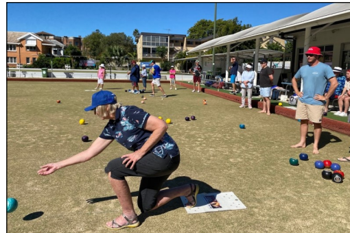
(left) New Farm Bowls Club, 969 Brunswick St, New Farm QLD 4005, look like they could do with some improvements to this green.