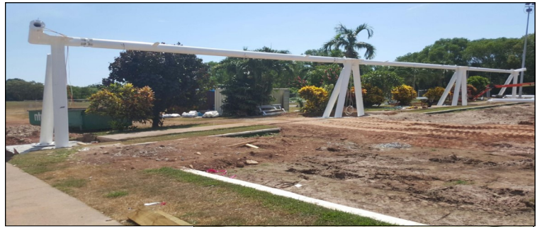
(above & right) Darwin Bowls Club has recently installed a new covered artificial green.