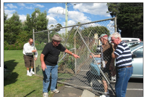
Side fence was upgraded

Sadly, several in these photos are not with us in 2023. But we remember them as friends and an important part of the history of our bowls club.