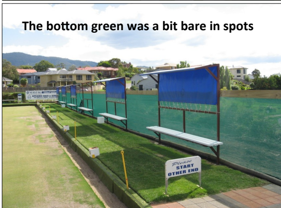
The bottom green was a bit bare in spots