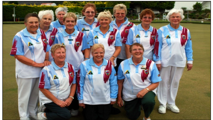
Div 5 Women's team did pretty well.