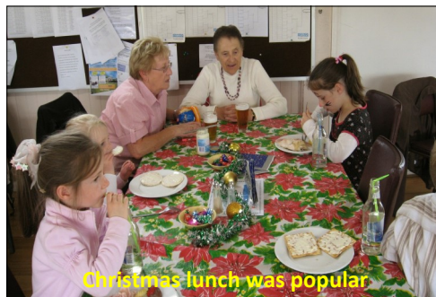
Christmas lunch was popular