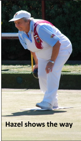
Hazel shows the way