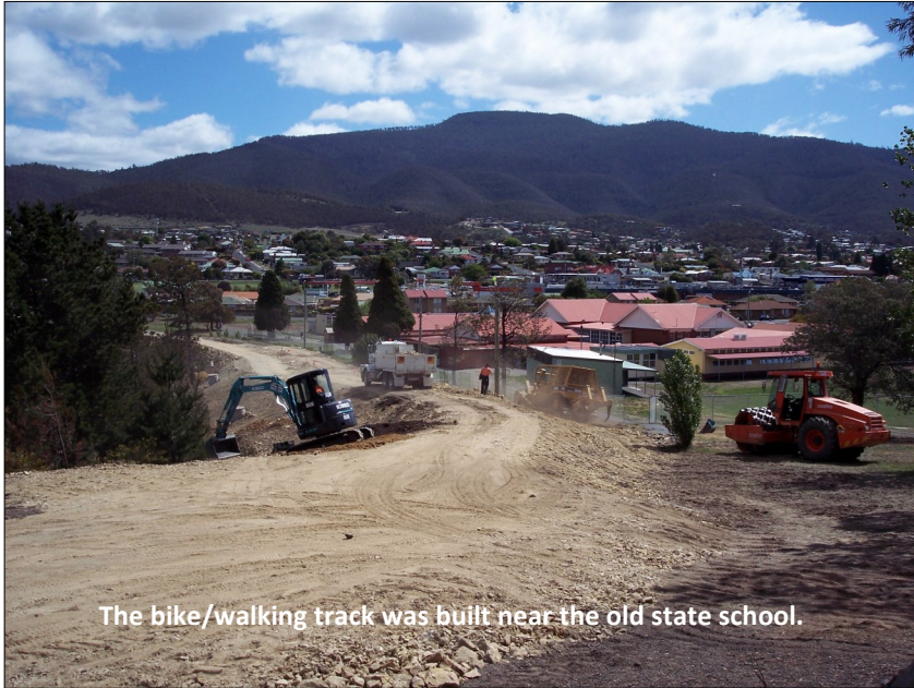
The bike/walking track was built near the old state school.