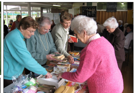
Soup & Sandwich lunch & trade table