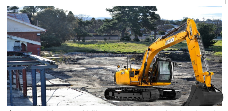
(above) Activity: The old Claremont Primary site is being cleared at long last. The main building, which is listed, will remain but the rest will go. We understand a new plan has been submitted to the council which contains less units that the original. Maybe by 2024/25 the construction will begin.

further example of the perils of putting new players into strange positions happened, fortunately, in a social game. In order to teach his friend something about building a head the Skip had put him at number Three. The Skip drew a beautiful shot which touched the jack. "Don't forget to mark that toucher", shouted the Skip, and his new number Three obligingly bent down and confidently put a large chalk mark on the jack!