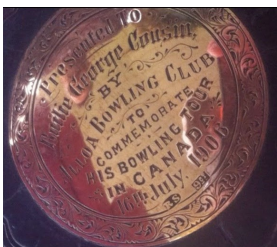
(left) Bowls Commemorating the 1906 Canadian tour

During the 1906 Tour by the eight rinks of British Bowlers, one of the more than 20 Central Canada's Canadian Lawn Bowls Clubs visited was the Montreal "Westmount Lawn Bowls" club which still operates on Sherbrooke Street in Montreal. The below photo, from an earlier web page posting of the club may even show some of the players who participated in welcoming these visiting bowlers. On Saturday 28th July 1906 at 3pm; the bowlers met and the local newspaper quoted the event as "Westmount Club made Gallant but Ineffectual Struggle. "