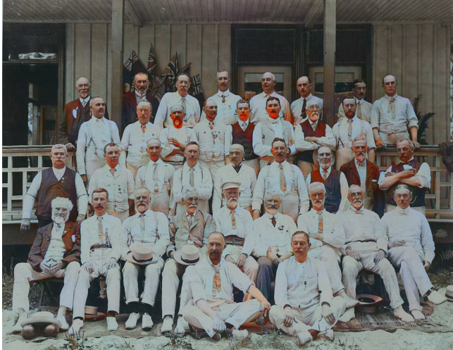
(above) British bowls team visiting Canada, 1906

"Heading off across the Pond" was how it was described in Europe as lawn bowlers of both sides of the Atlantic prepared for a two Month Lawn Bowl Tour of Canadian Lawn Bowls Clubs by United Kingdom lawn bowl clubs.