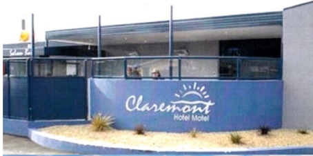
(left) Before And (below) After