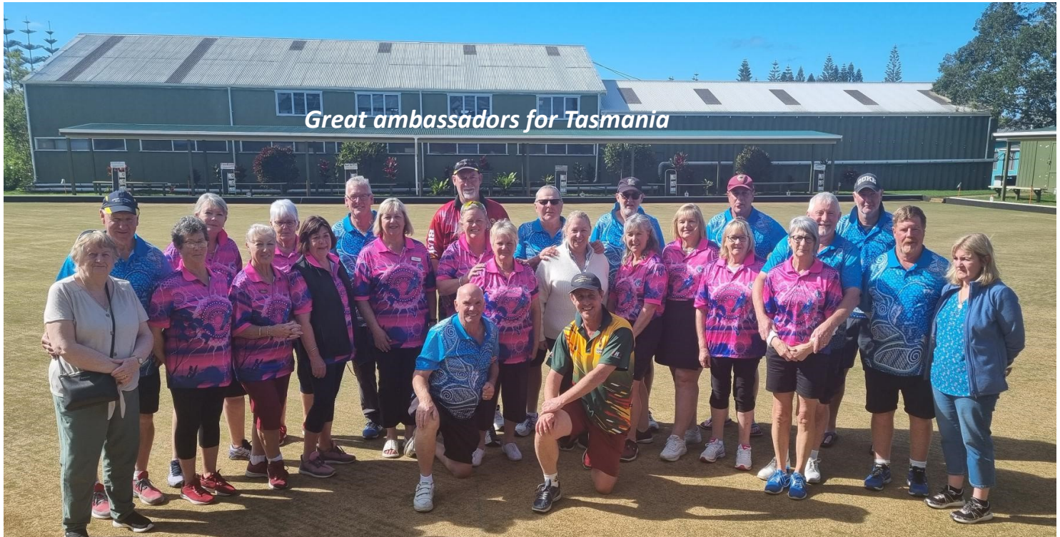
Great ambassadors for Tasmania