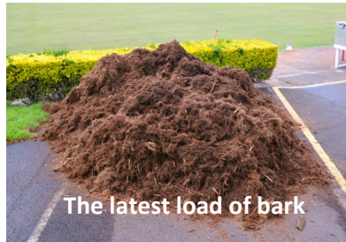
The latest load of bark

Also a big thank you to Rob Batge, Winston Lane and Warren O'Rourke for their fantastic efforts in spreading the pine bark on the bank of the bottom green. These 3 tireless workers moved all the pine back from the car park to the bank ....great effort