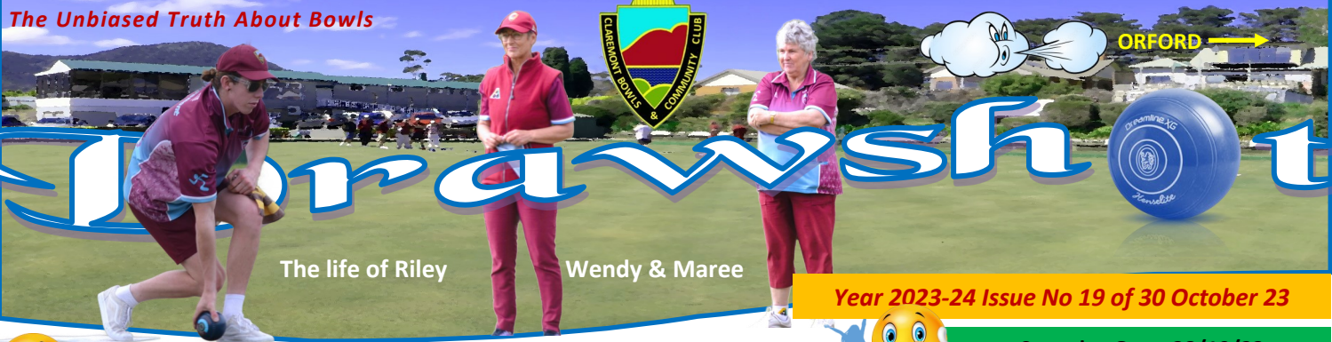
The life of Riley