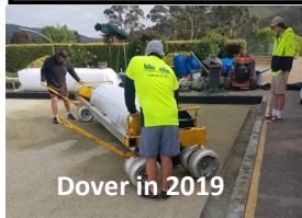
Dover in 2019

Each week we will highlight one or two of our sponsors. They fund us in different ways, so don't expect discounts at their place of business!