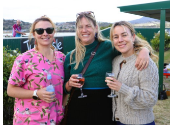
(left) Three of the medical people who had some fun on Saturday eve.