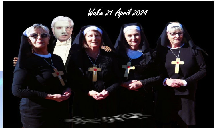
The Phantom sang "The top green is past the point of no return."