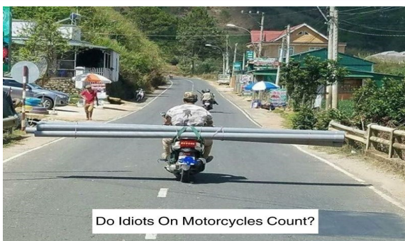
Do Idiots On Motorcycles Count?