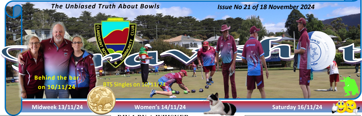
Behind the bar on 10/11/24